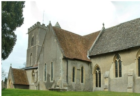
The picture on the left dates from 1843; the one on the right is a recent photo. The building hopefully will still retain its appearance in another 150 years, but there are a few differences to spot that show that it is not just a piece of history!