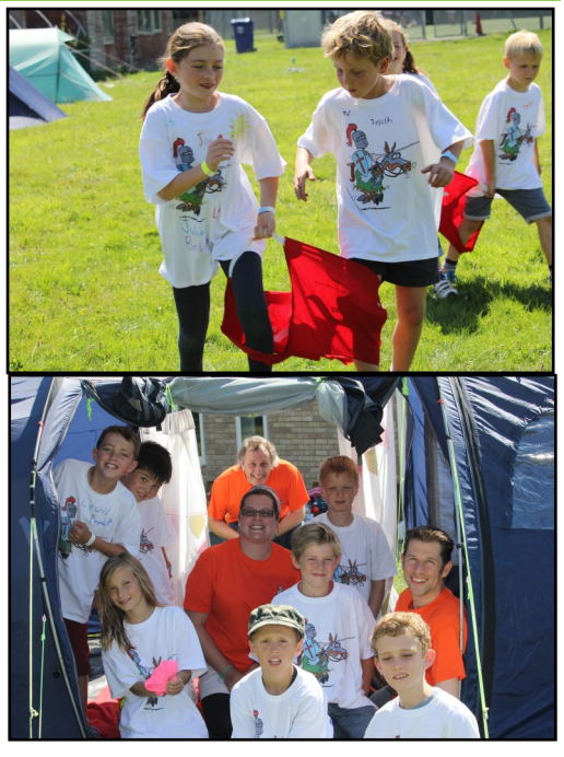
If you or your children came along to the Club, we hope that they really enjoyed the week. For more Holiday Club fun, families are warmly invited to join us on Sunday 4th September at 11am at St Matthew's for a Return to Camelot. Don't forget to bring a picnic lunch for after the service.