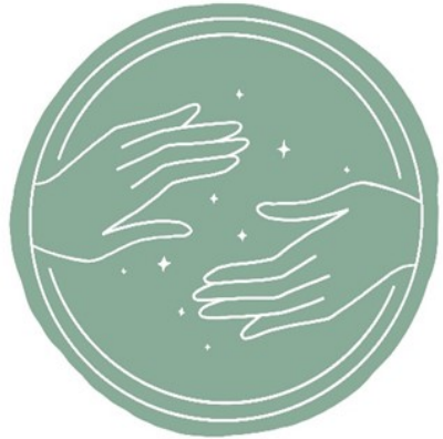
CHILTON MUTUAL AID

Local councillors also helped us to secure a grant of £500.