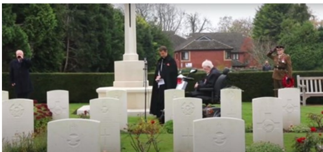
Photo: A socially distanced Act of Remembrance at the war graves in Harwell cemetery; screenshot from livestreamed video