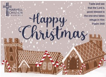
The 2020 church Christmas card delivered to every home in the Benefice

In 2020 the focus of the Administrator's work shifted away from the production of materials to support in-person worship services and towards supporting the production of weekly online worship services. The Administrator also supported several online discipleship groups during the year – Alpha, Christianity Explored and the 'Connect' groups mentioned in section 2.6.