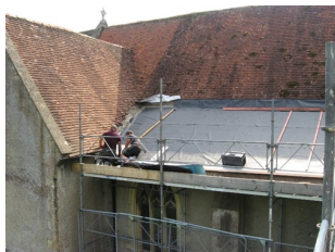
Photo: Starting re-roofing work on the north aisle, September 2020; Tony Hughes

The next Quinquennial Inspection of the church by the Church Architect was due in 2020, but has had to be postponed to 2021.