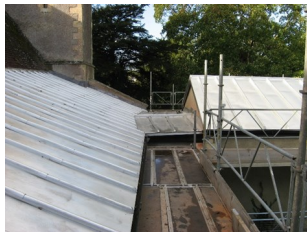
Photo: The north aisle and extension roofs, nearly finished with terne coated steel, October 2020