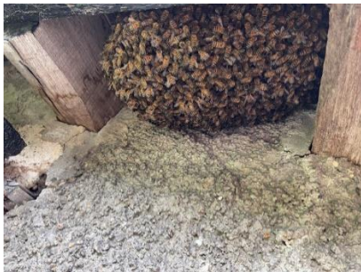
Photo: Bees under the eaves, May 2021

Examples of other work are in the Fabric Report.