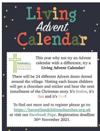
Image: Advert for 'Advent Doors'

In December we ran ' Advent Doors ' in our usual way of hearing part of the story each day from a home in each village.