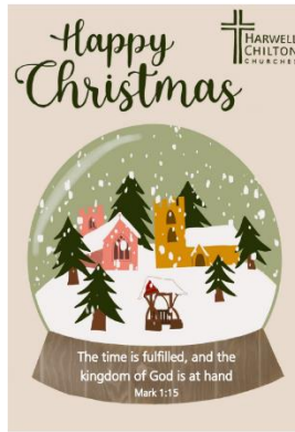
Images: the 2021 church Easter card and Christmas card delivered to every home in the Benefice