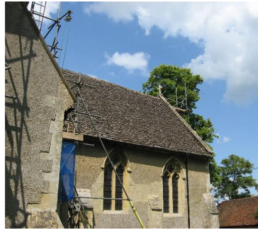
Work to replace the broken finial crosses