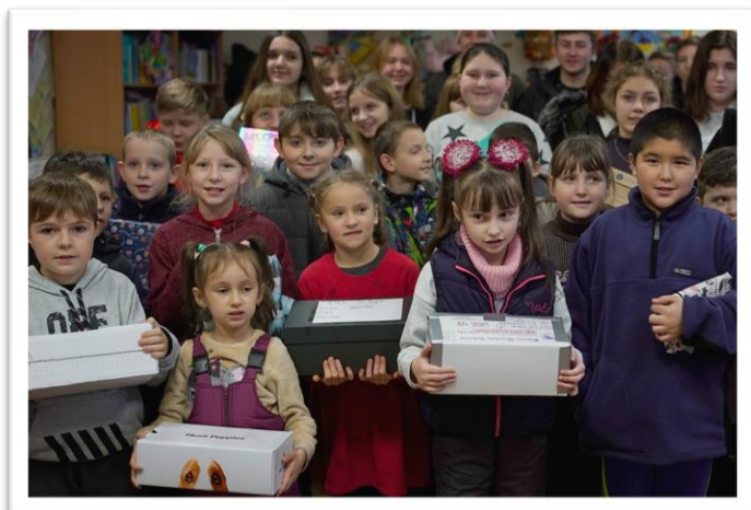
Our Christmas Toy Service gifts were sent to Lyman in the Donetsk region of Ukraine.