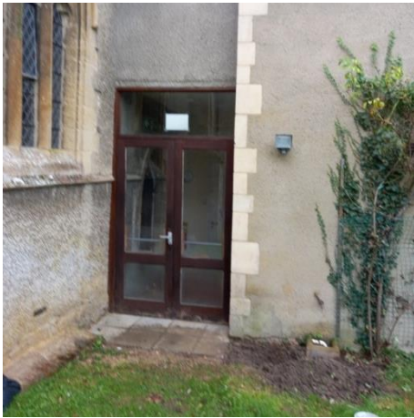
The extension door, site of flooding